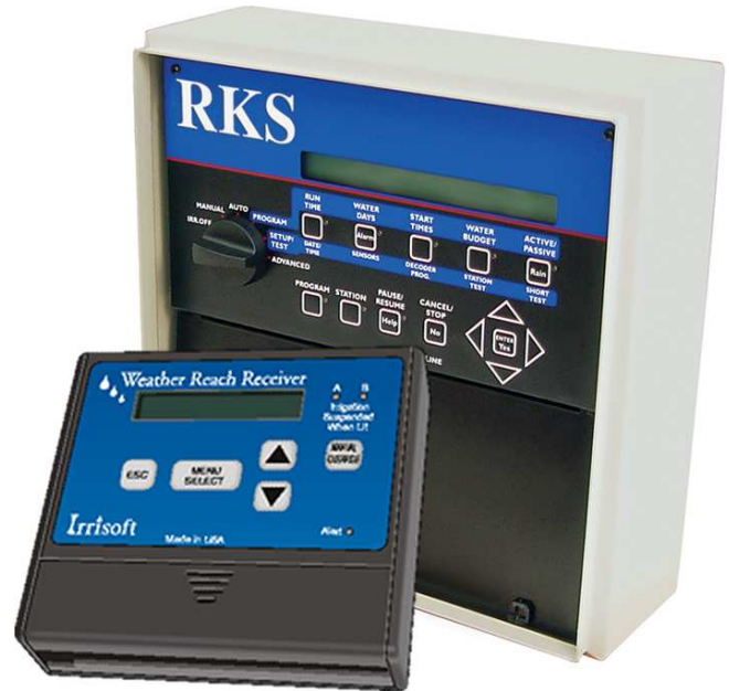
Weather-based control module for Tucor RKS controller.