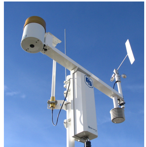
One of ExactET's 37 weather stations.