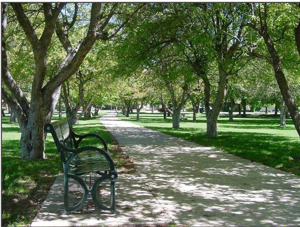
Achieve more with Weather Reach.

Hourly messages are received by each receiver with up to date weather information from local weather stations.