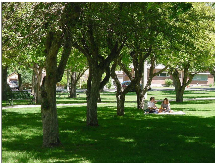
A young family enjoys a beautiful Adams Park provided by Weather Reach.

L ocated in a high mountain valley in northern Utah is the beautiful community of Cache Valley. With the Wellsville Mountains surrounding it to the west and the 10,000 foot Bear River Range to the east, the city of Logan is full of picturesque views. With the Weather Reach Water Management System in control, its parks are as beautiful as the surrounding mountains.